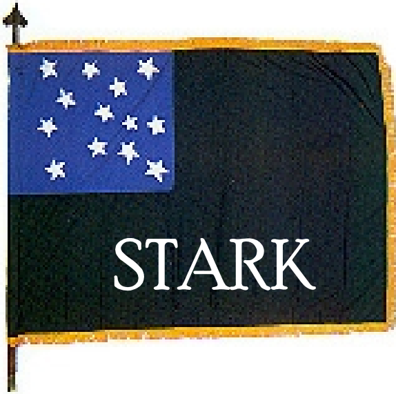
Stark's Brigade Standard